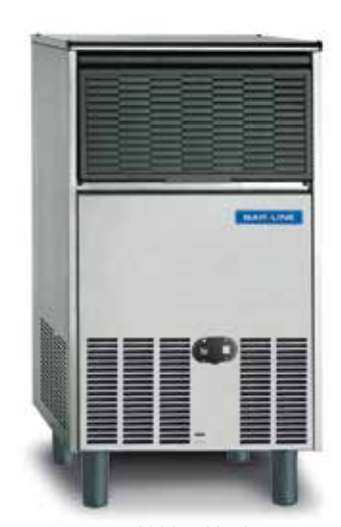
B 6022 AS/WS

Bar Line Equipment range is the newly released EU made ice makers for Thimble-shaped rounded ice cubes coming from Bar Line.